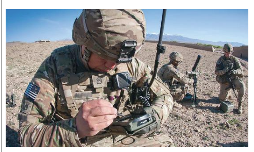
A Common Hardware Systems contract with General Dynamics Missions Systems and partners provides the Army with rapid delivery of tactical IT equipment and services.

The various phases of CHS programs were developed to provide speedy tactical information technology (IT) solutions for the various branches of the military (see photo). The different military branches and Department of Defense (DoD) program offices participating in the CHS programs can complete IT hardware orders in 90 days or less using commercial-off-theshelf (COTS) IT hardware and services. As many as 100,000 pieces of hardware will be acquired through the contract from General Dynamics Missions Systems and its partners.